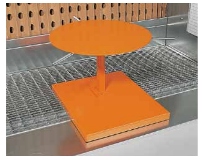
The rotating plate enables the painting of difficult parts. (special accessory, Art.No. 517 180)