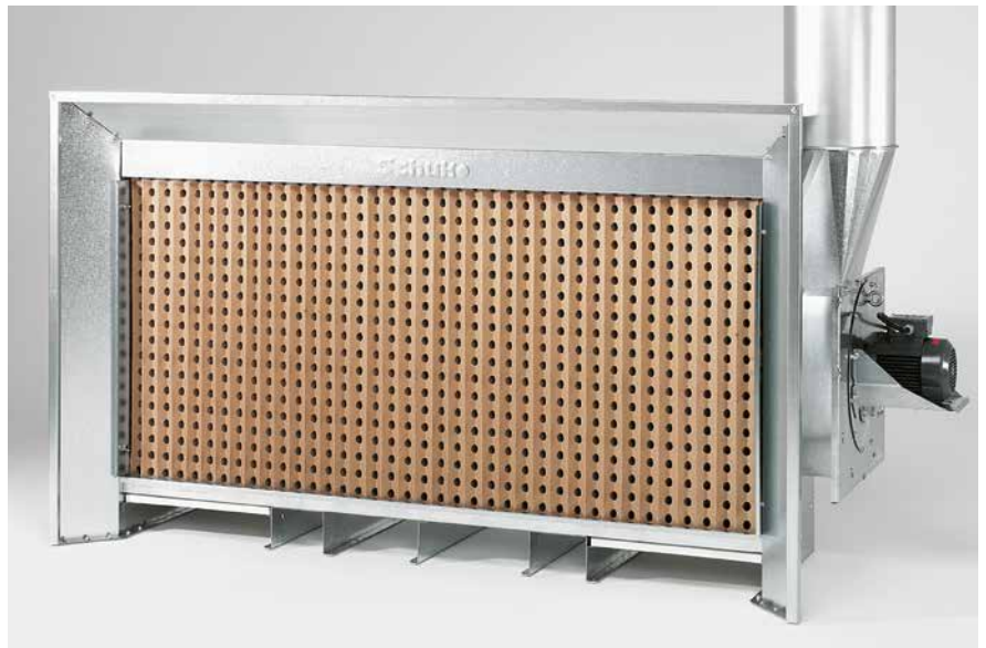
Solid compact design with low construction depth - just right for small rooms and workshops.

Your workshop, your staff, your neighbours and your own health will all feel the benefits.