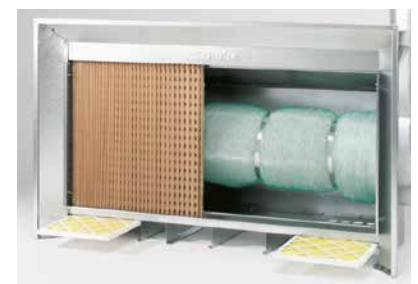
Easy accessibility ensures fast, trouble-free replacement of the cost-effective filters.

With the Schuko ColourMAX , not only the price is right. You enjoy proven high Schuko quality at the most economical price possible. Even if you only carry out spray work occasionally, there is now no longer any reason to do without a paint spray suction panel for reasons of cost or space.