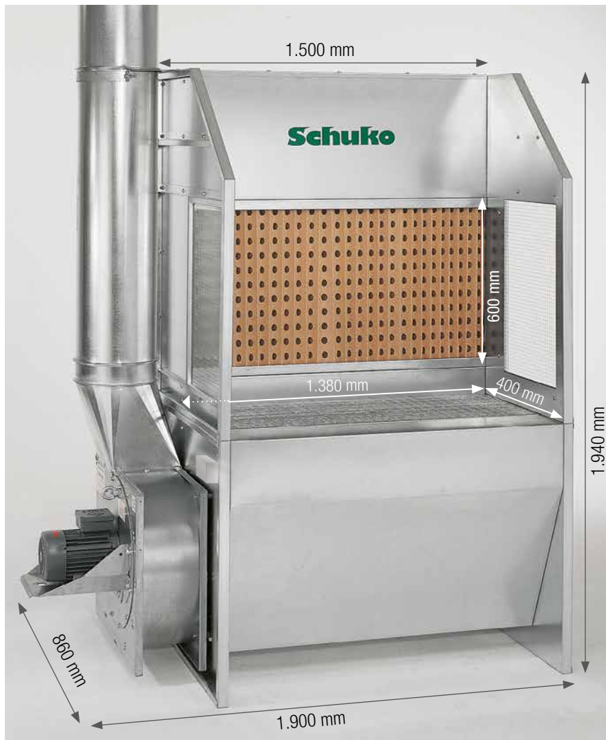
The ideal equipment for aspiration paint vapour and spray.

– that's Schuko performance in the smallest of spaces