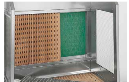
The filters, preliminary and fine filter, can be replaced when required in only a few steps.